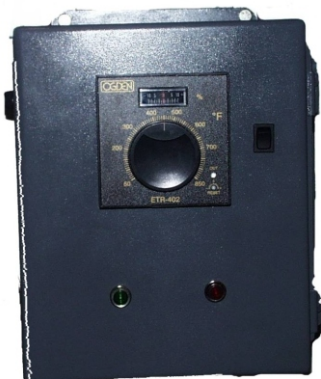
Control Panel for Gas Model